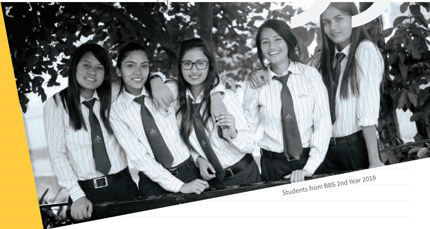
Students from BBS 2nd Year 2018